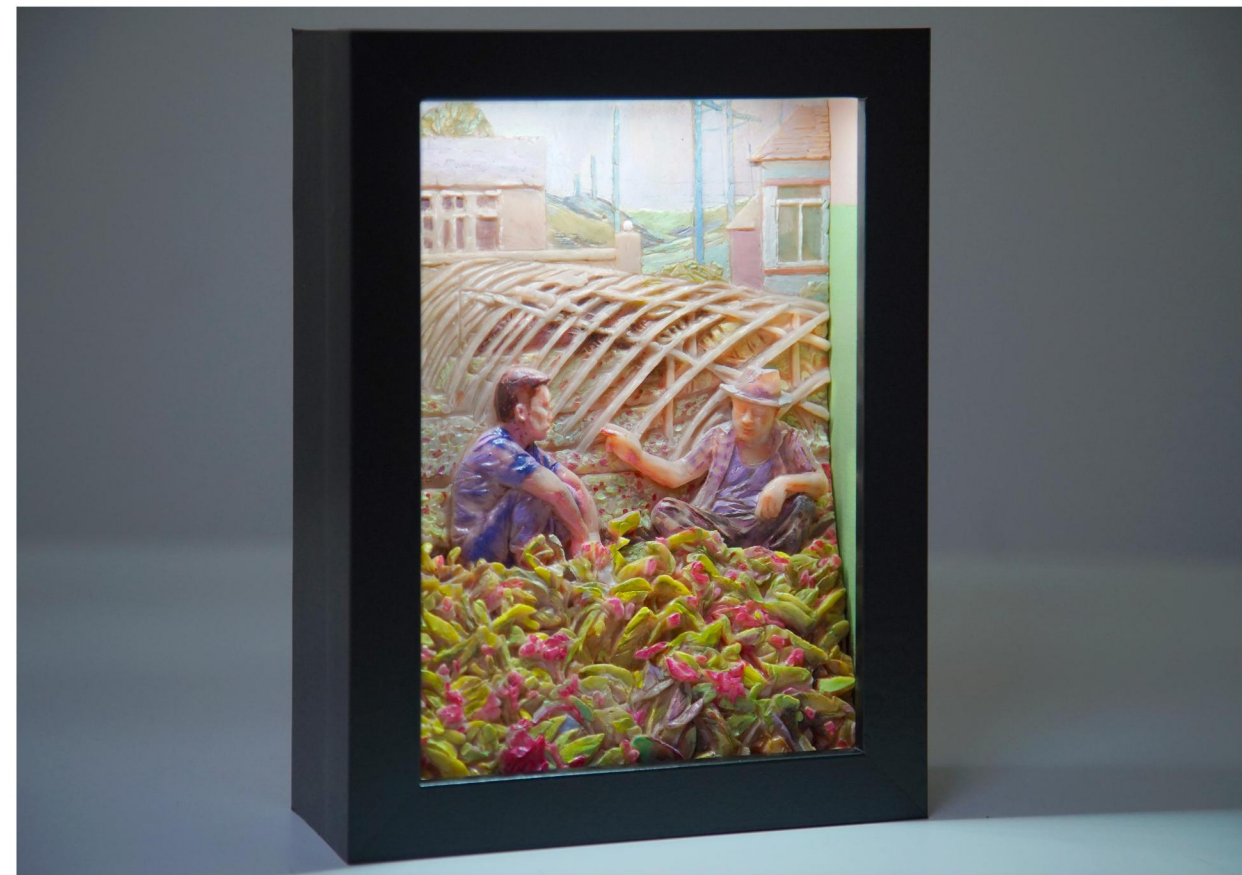
Country Love: I'm Telling You... , 2019 Acrylic on resin, wood and LED light, 8×6×2.5 inches