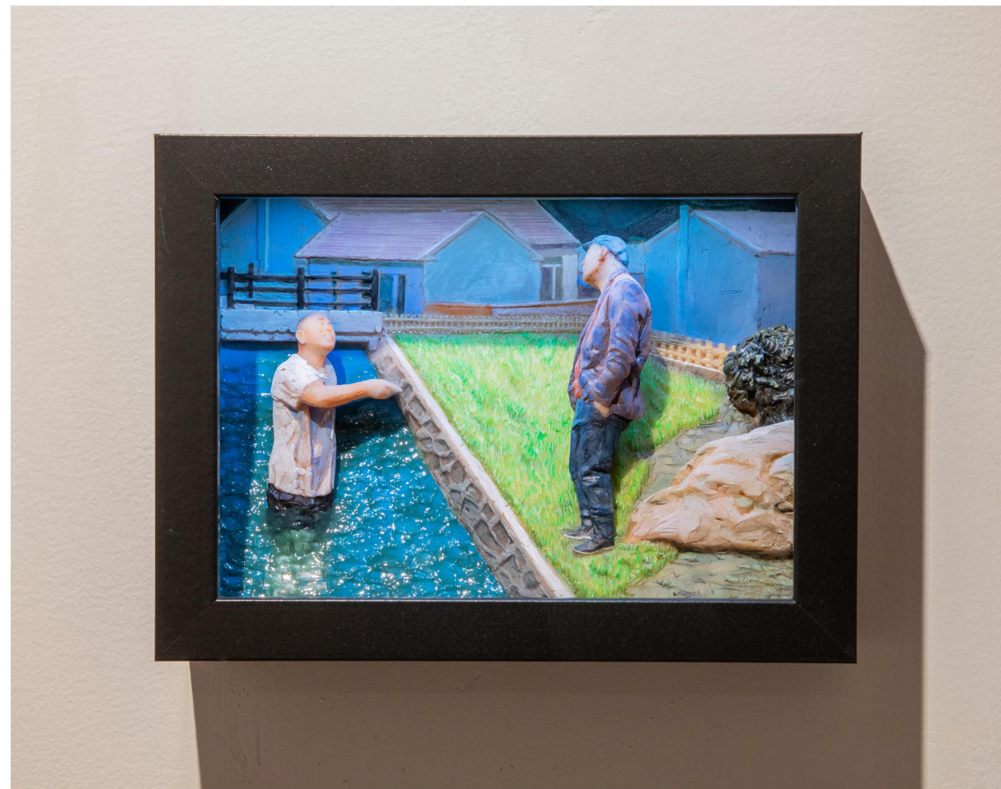
Country Love: My Daughter Will Not Marry Your Son , 2020 Acrylic on resin, wood and LED light, 6×8×2.5 inches