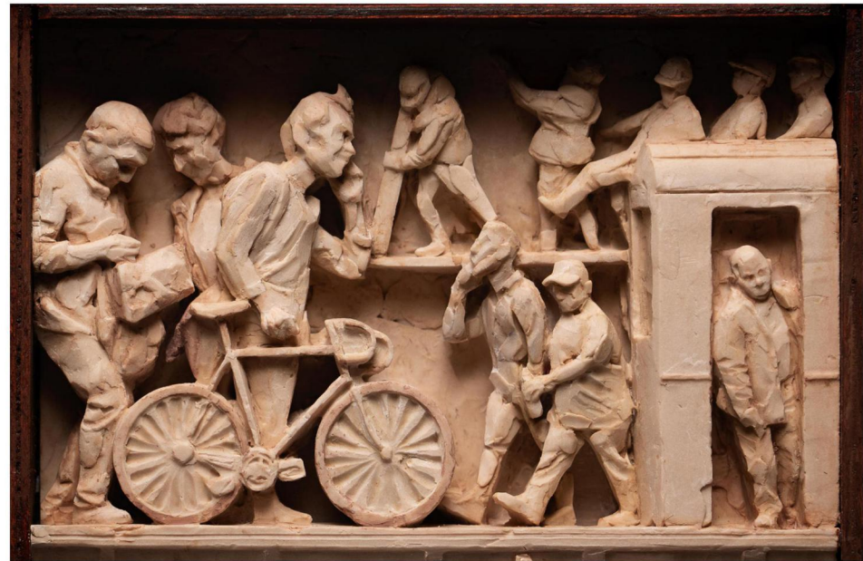
The Curious Case (奇幻之旅) , 2018 Acrylic on resin, metal and wood, 16 x 19 x 4 inches