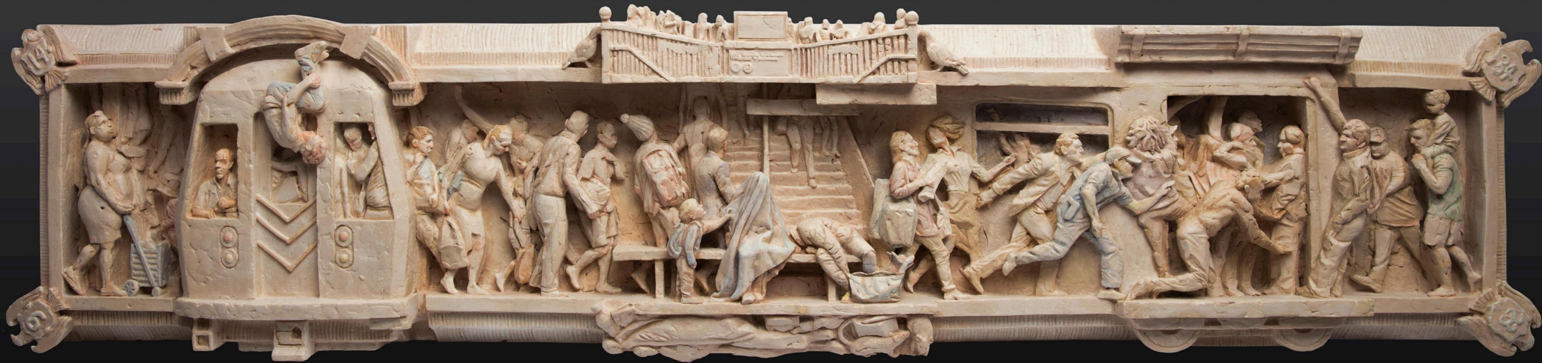
42nd Street Station , 2018 Painted resin, metal 42" x 9.5" x 3"