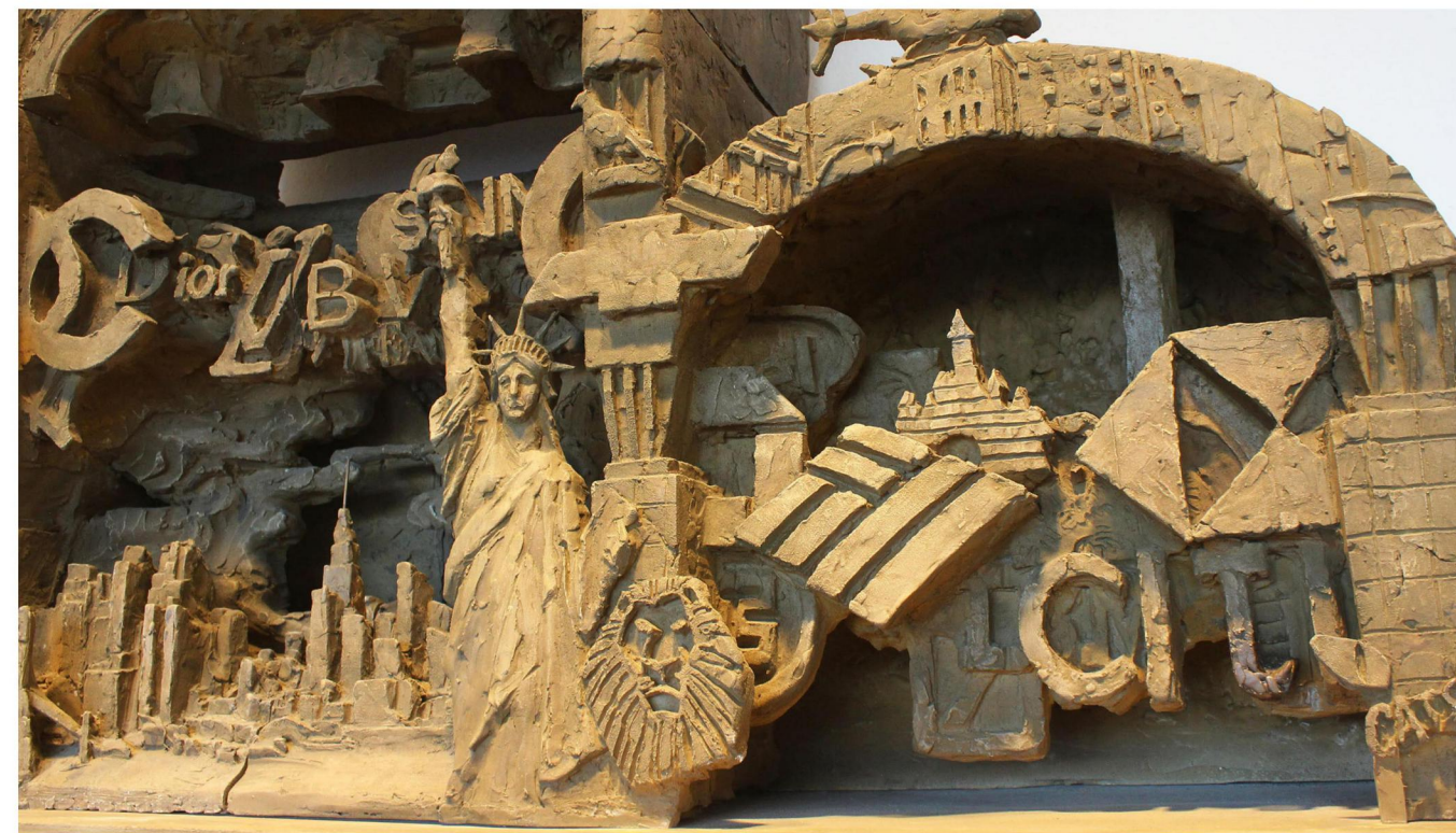
New York New York , 2016 Resin, 60 x 51 x 11 inches