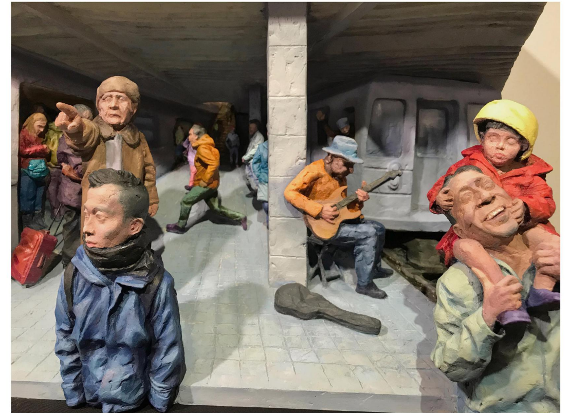
Franklin Station , 2018 Acrylic on resin, wood and metal, 12.75 x 22.5 x 10 inches