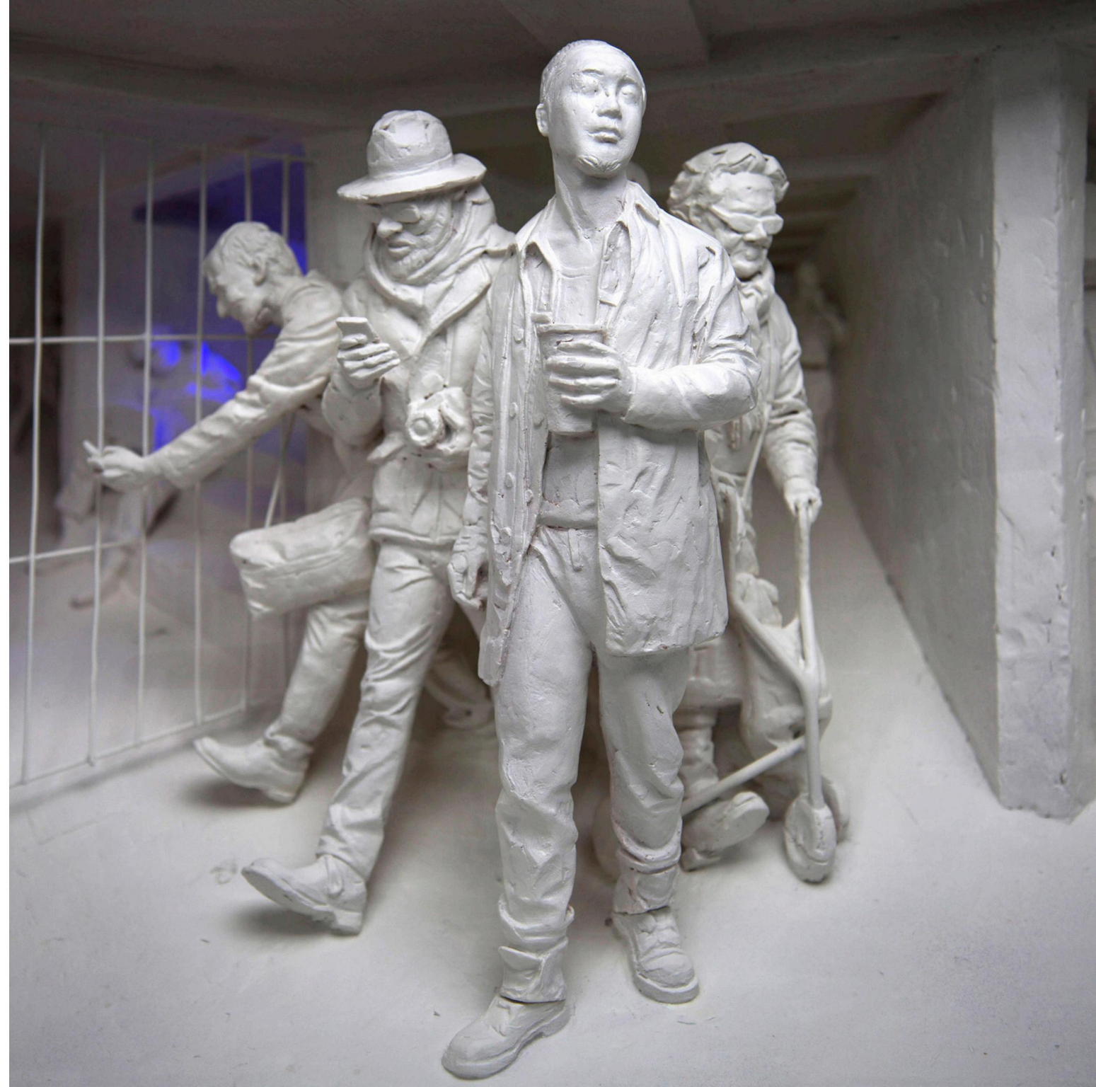
Newport Station, 2017 Acrylic on resin, wood, light bulb 14" x 28" x 11"