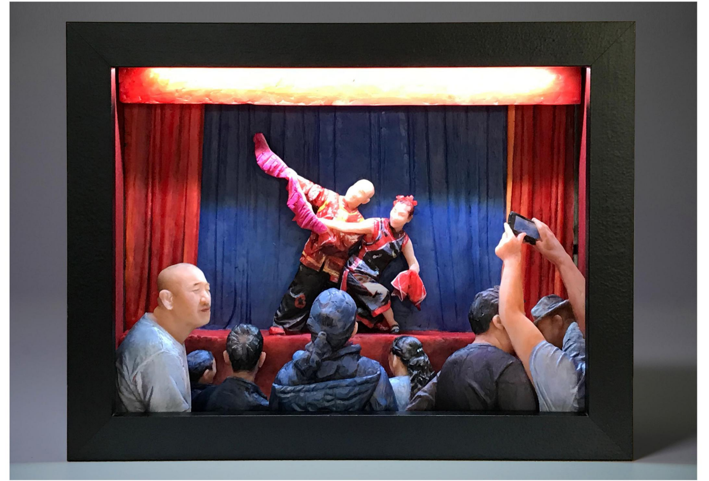
Country Love: Big Show , 2020 Acrylic on resin, wood and LED light, 7×9×3 inches