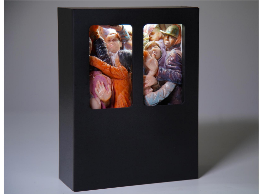
Chaos , 2019 Acrylic on resin, wood and LED light, 8×6×2.75 inches