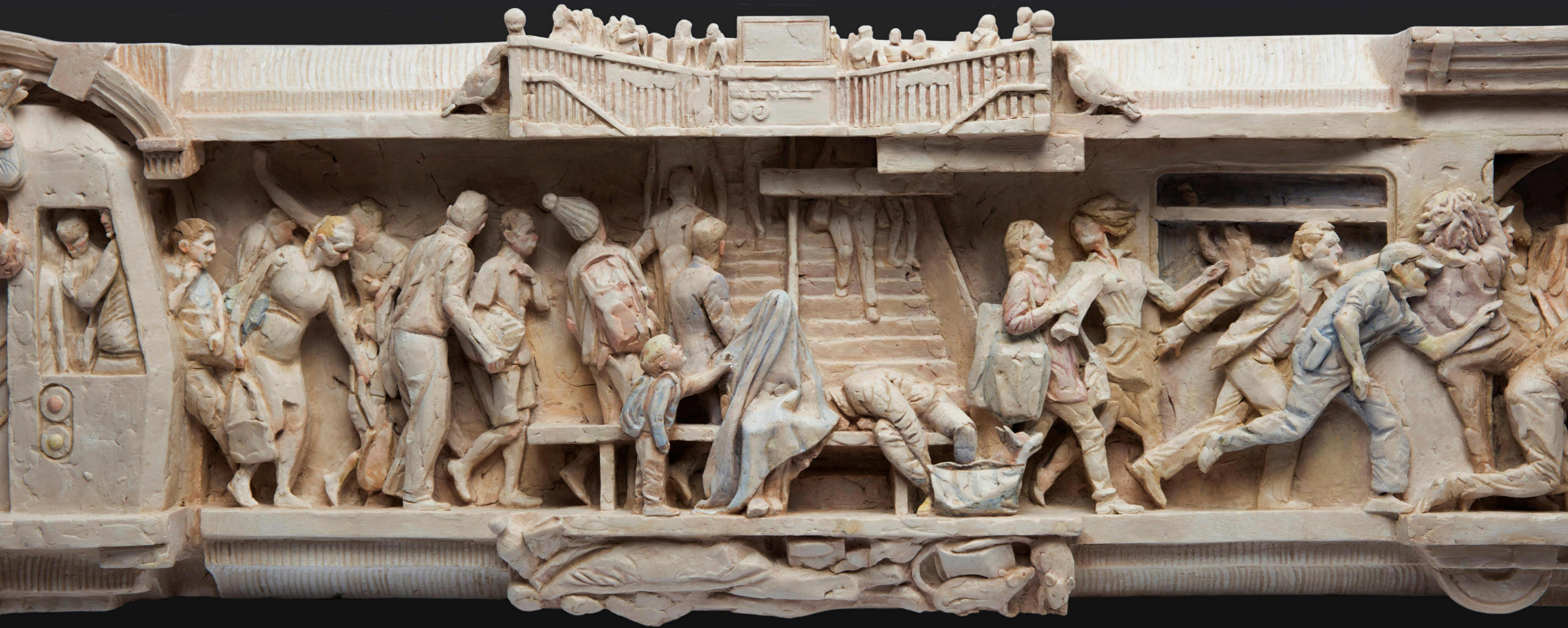
42nd Street Station , 2018 Painted resin, metal 42" x 9.5" x 3"