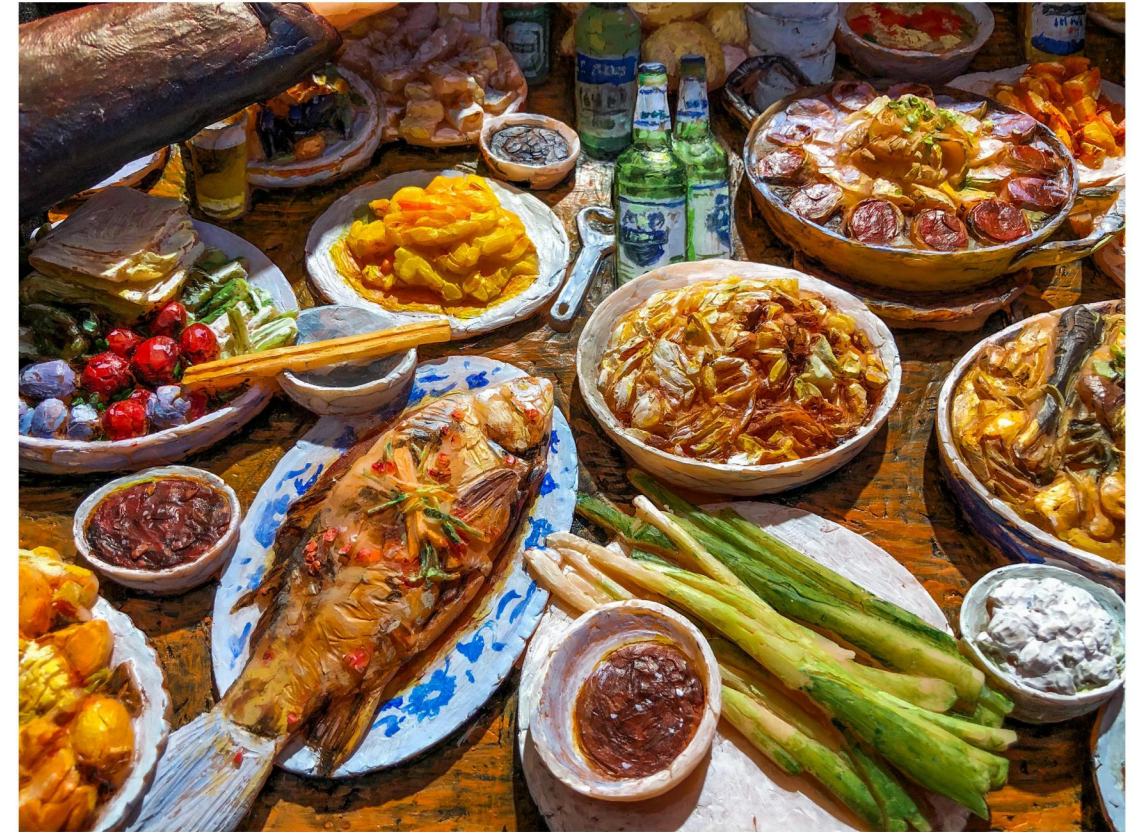
Country Love: Classmate Reunion , 2020 Acrylic on resin and wood, 9×9×3 inches