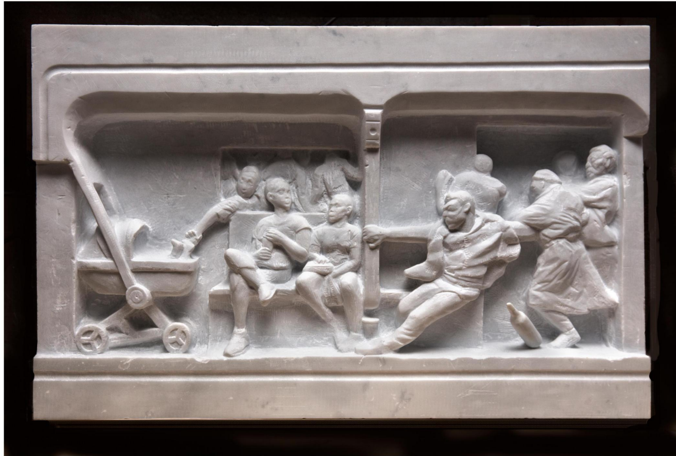
Y Train , 2017 Carrara marble 17" x 26.5" x 4.25"