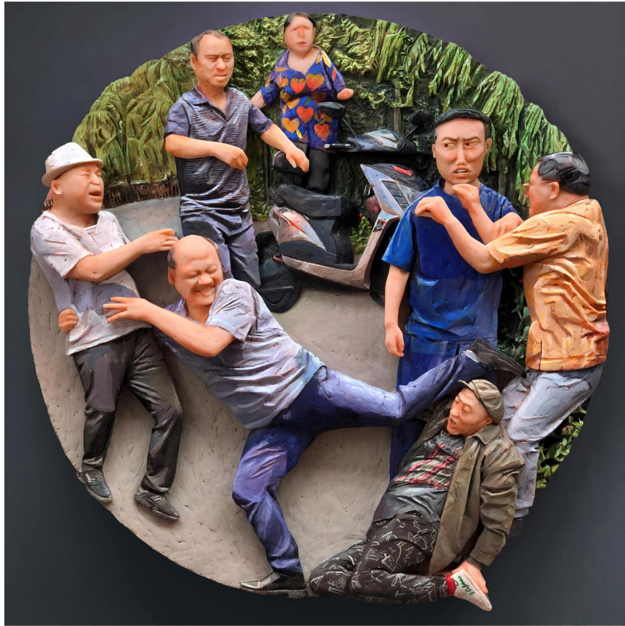
Country Love: Gang War , 2020 Acrylic on resin ,metal and wood, 14×14×5 inches