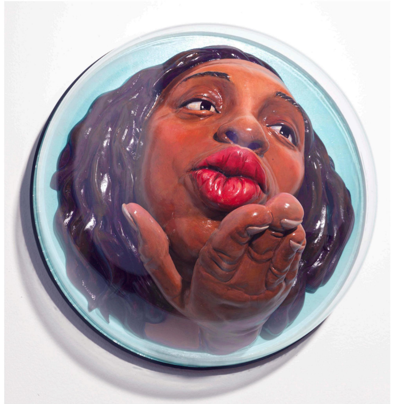
Selfie Wendy, 2016 Acrylic on resin, wood, plastic 14" x 14" x 7"