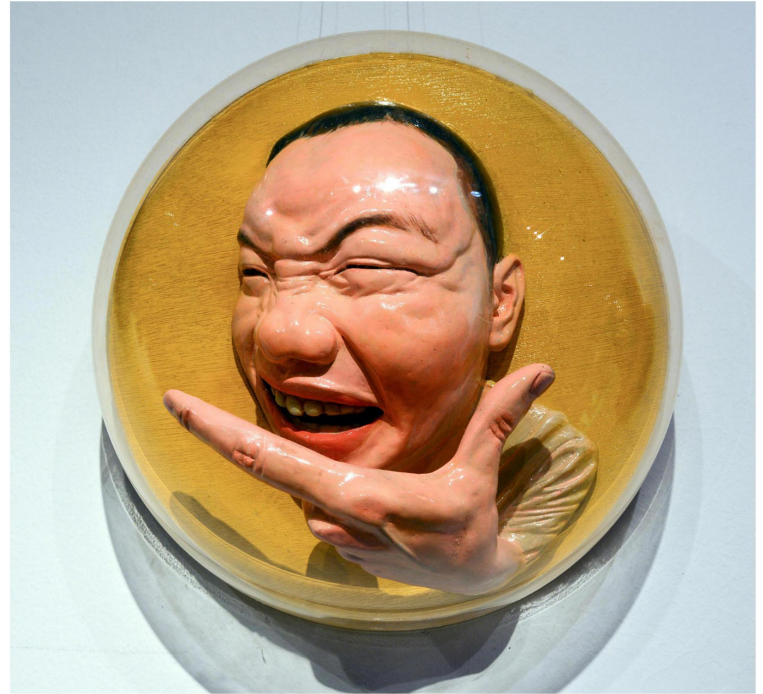
Selfie Xianda, 2014 Acrylic on resin, wood, plastic 14" x 14" x 7"