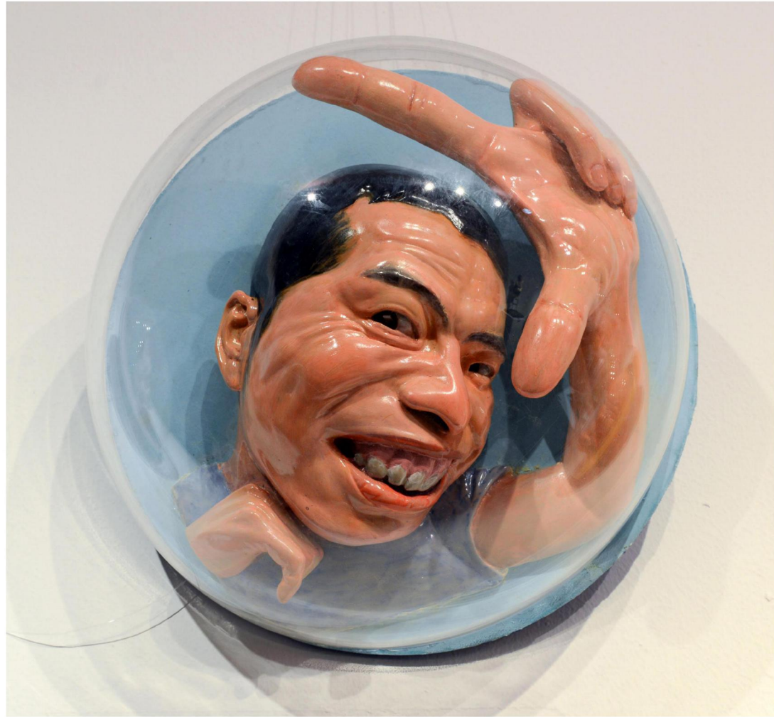
Selfie Quanhai, 2014 Acrylic on resin, wood, plastic 14" x 14" x 7"