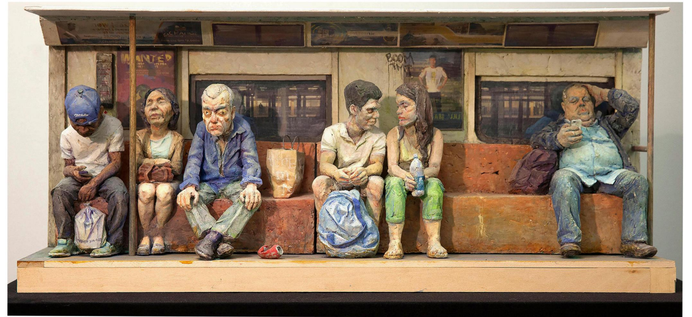
Z Train , 2015 Ceramic, watercolor, wood, metal, canvas 11" x 25" x 6"