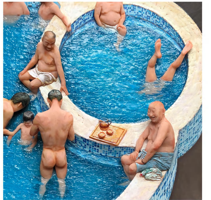
Untitled , 2020 Acrylic on resin and wood, 16×15×3.5 inches