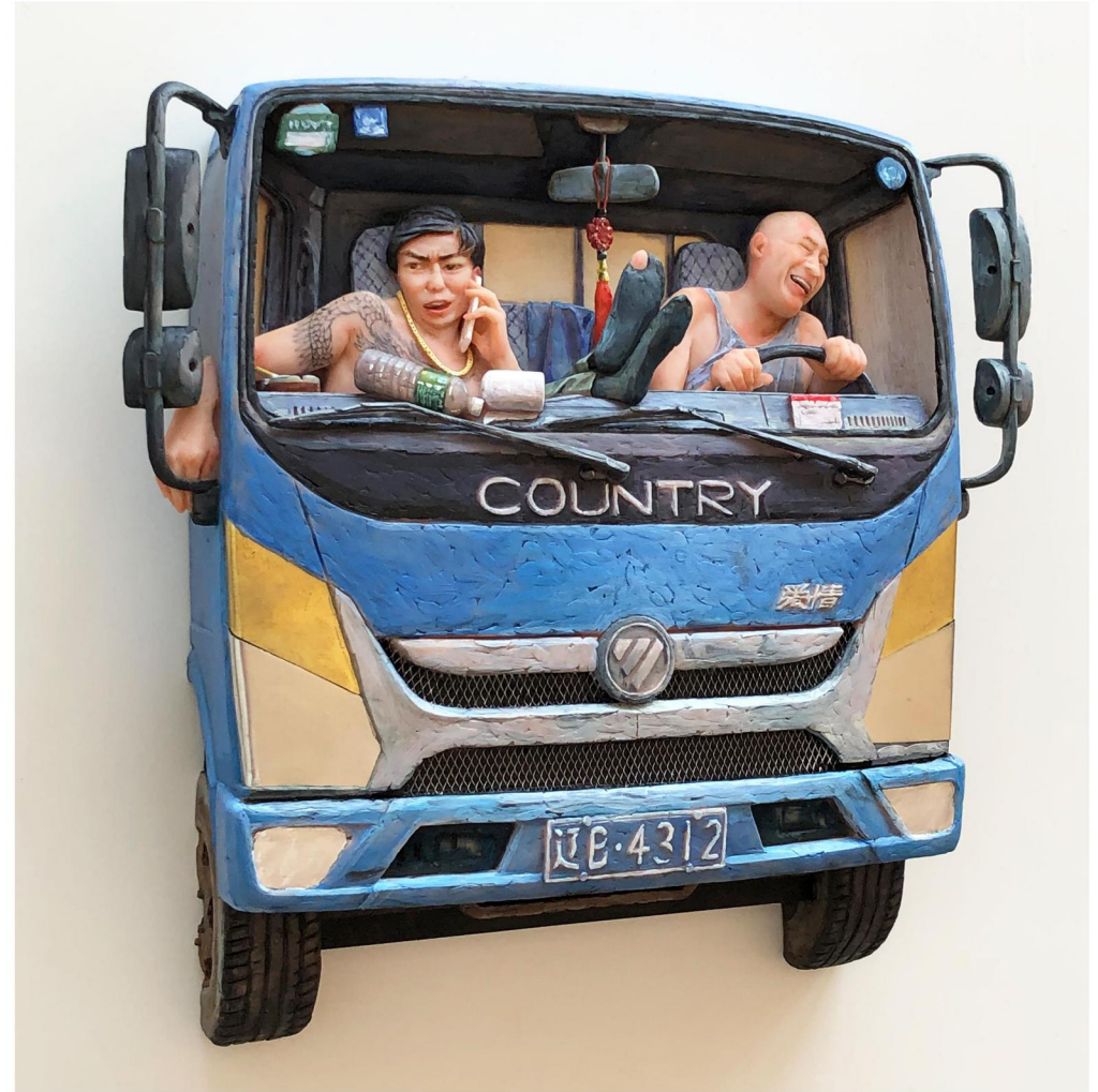
Country Love: On My Way , 2020 Acrylic on resin, metal and wood, 10×11×2.5 inches