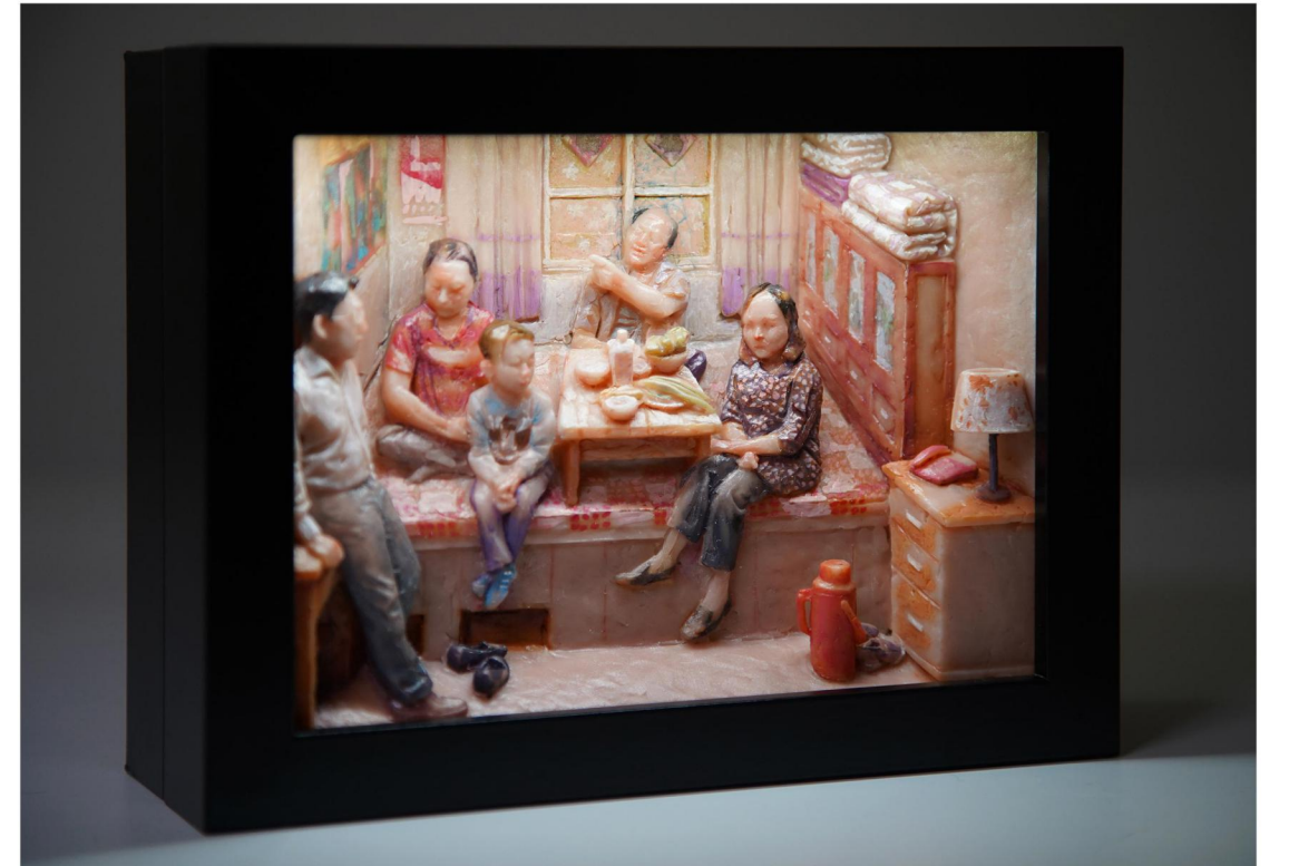
Country Love: That's All Your Fault , 2019 Acrylic on resin, wood and LED light, 6×8×2.75 inches