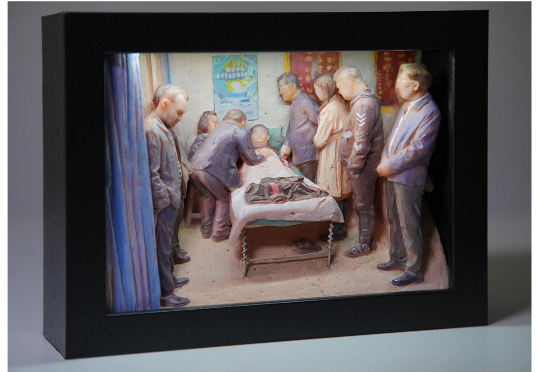
Country Love: Losing Weight Hurts , 2019 Acrylic on resin, wood and LED light, 6×8×2.5 inches