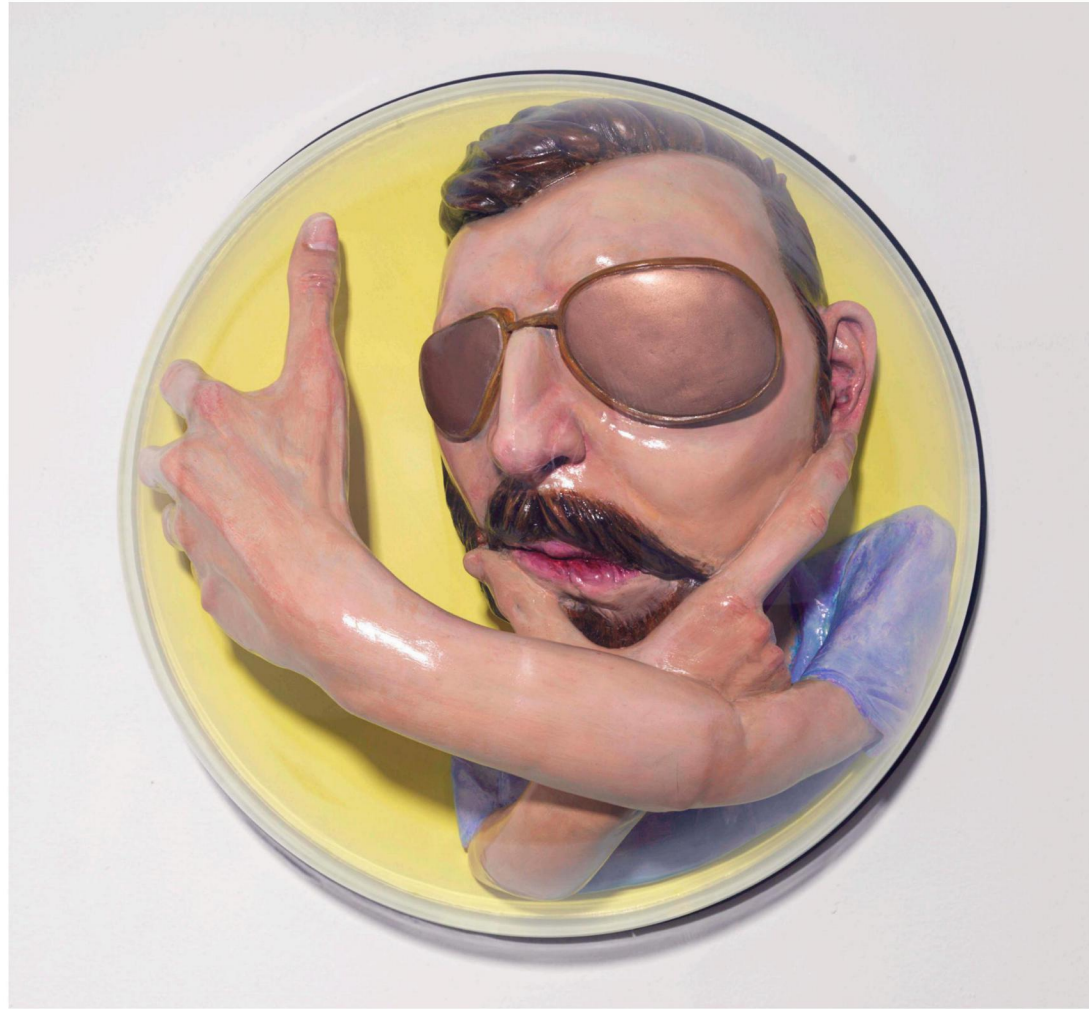
Selfie Dennis , 2016 Acrylic on resin, wood, plastic 14" x 14" x 7"