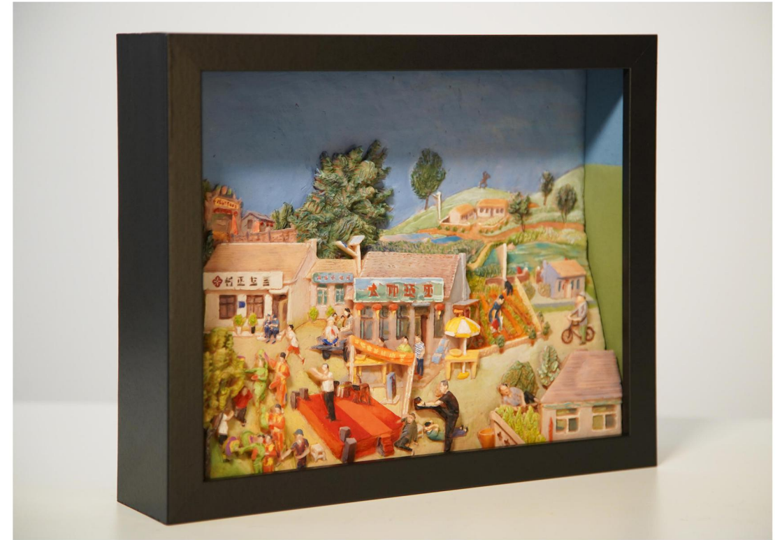
Country Love: Welcome the County Clerk , 2019 Acrylic on resin and wood, 9×11×2.5 inches