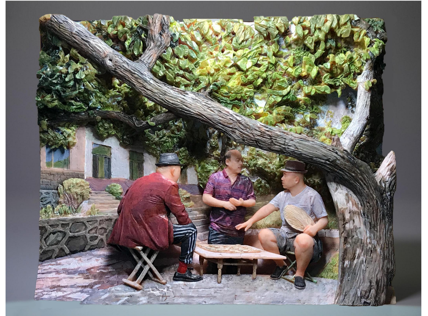
Trilogy II , 2020 Acrylic on resin ,metal and wood, 8×10×3.4 inches