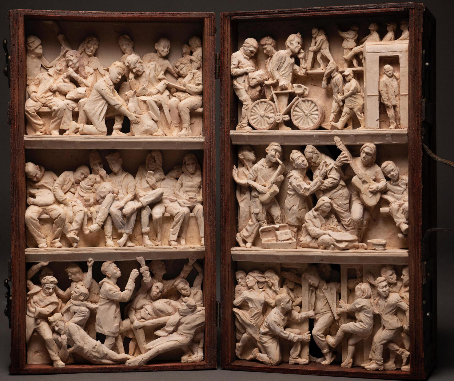
The Curious Case (奇幻之旅), 2018 Acrylic on resin, wood 16" x 19" x 4"