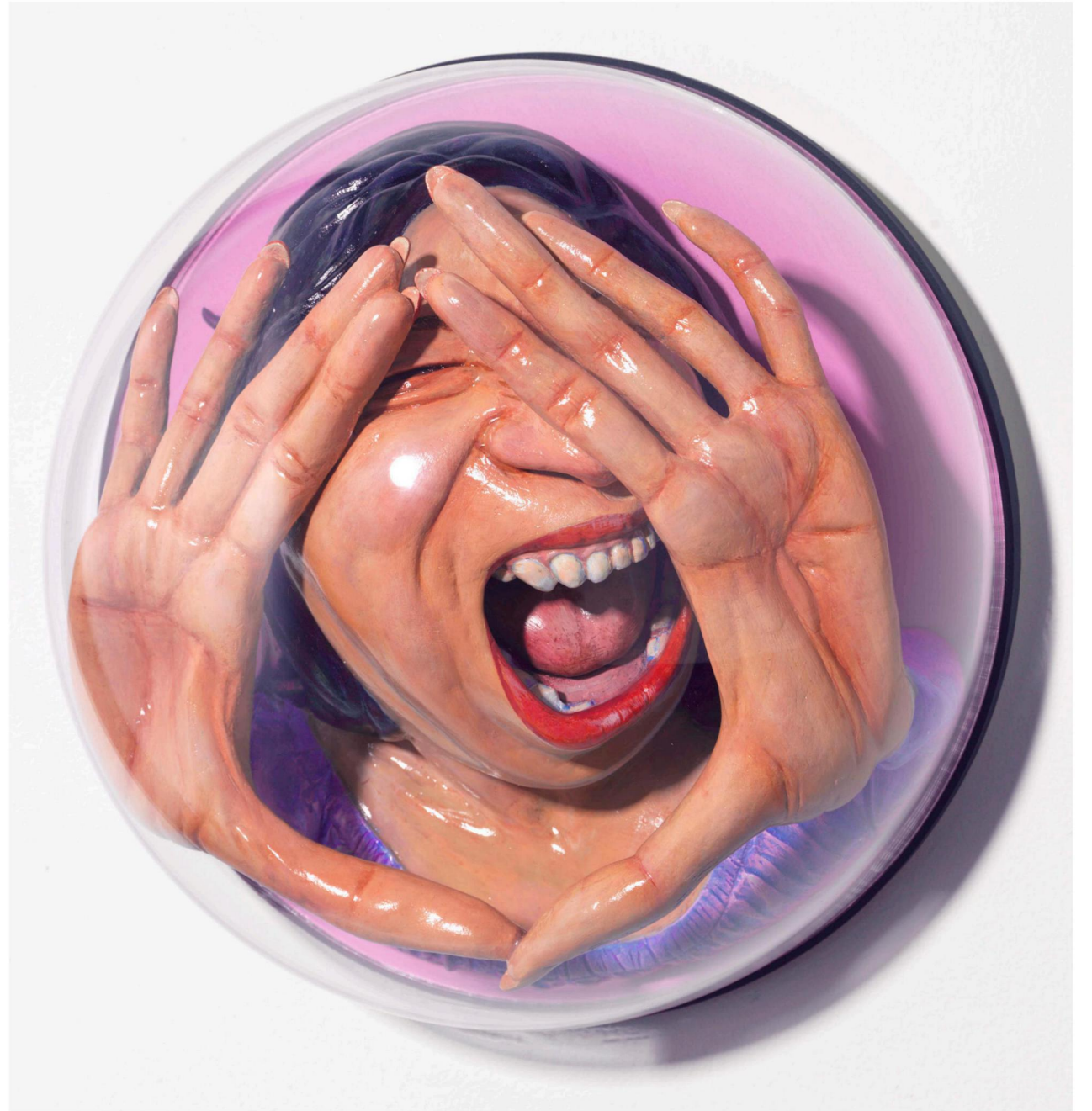
Selfie Kelly , 2016 Acrylic on resin, wood, plastic 14" x 14" x 7"