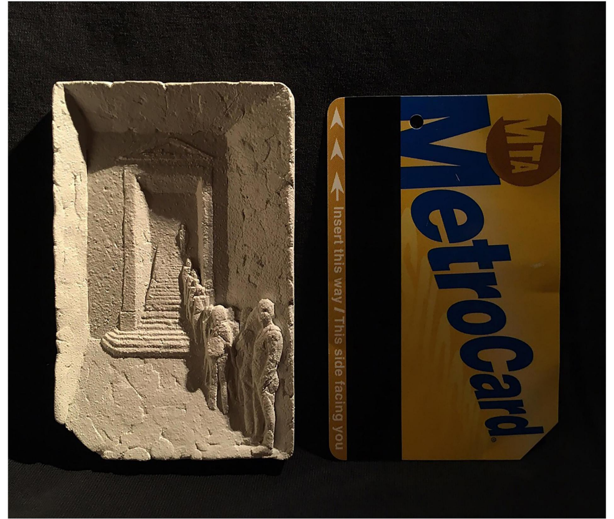
Subway on MetroCard , 2017 Resin on MetroCard, 3.4 x 2.1 x 0.5 inches