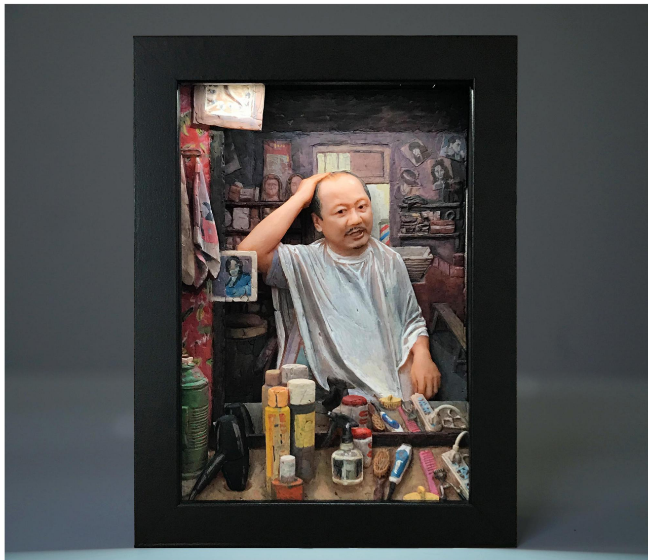
Country Love: New Look , 2019 Acrylic on resin, wood and LED light, 8×6×2.5 inches