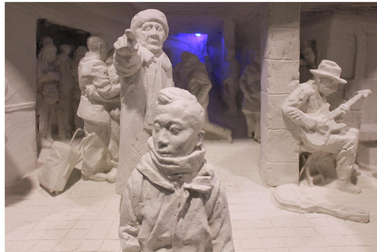
Franklin Station , 2016 Painted resin, wood, metal and LED light, 12.75 x 22.5 x 10 inches