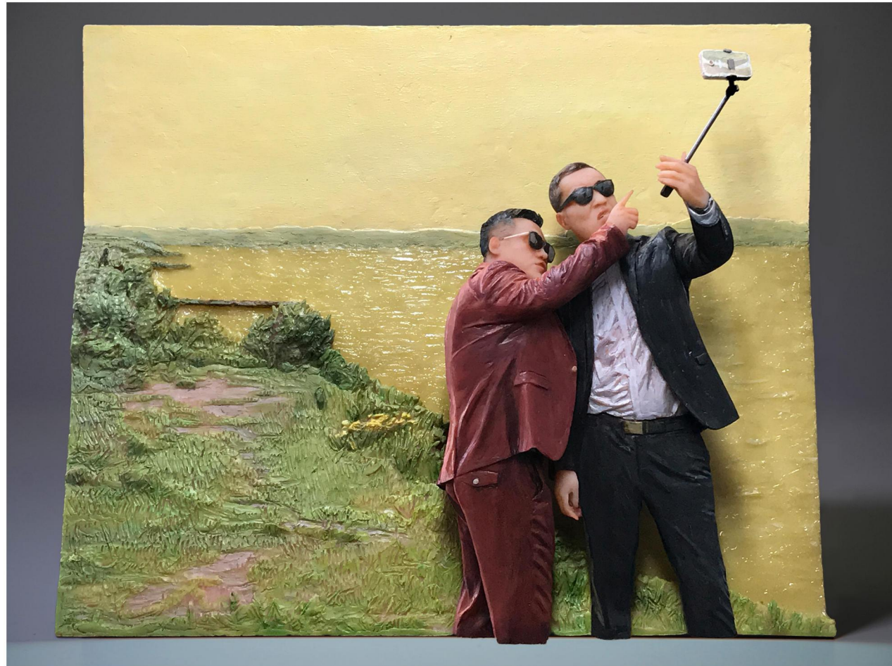
Trilogy III , 2020 Acrylic on resin, wood and metal, 8×10×3.7 inches