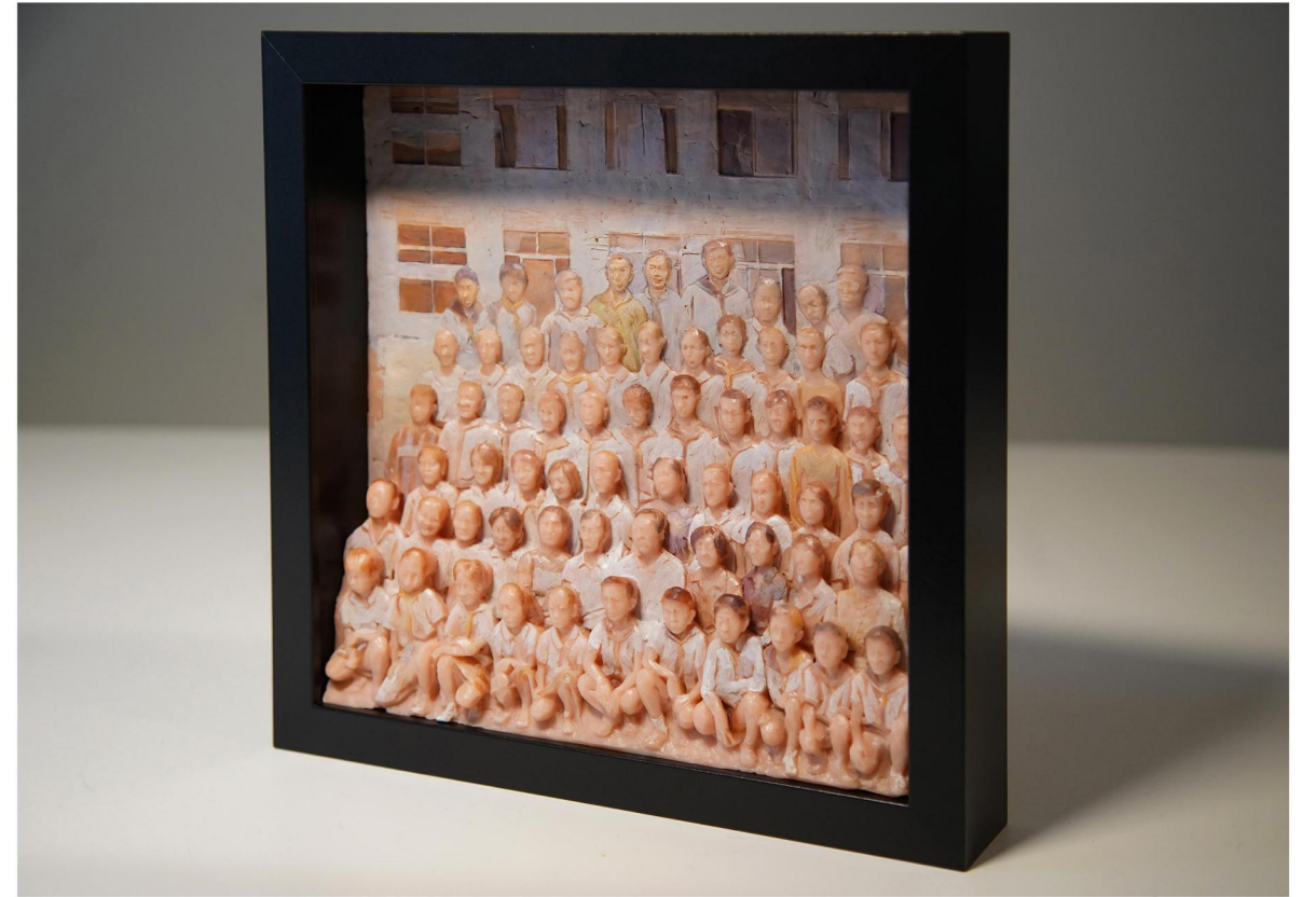
Graduation , 2019 Acrylic on resin and wood, 10×10×1.75 inches