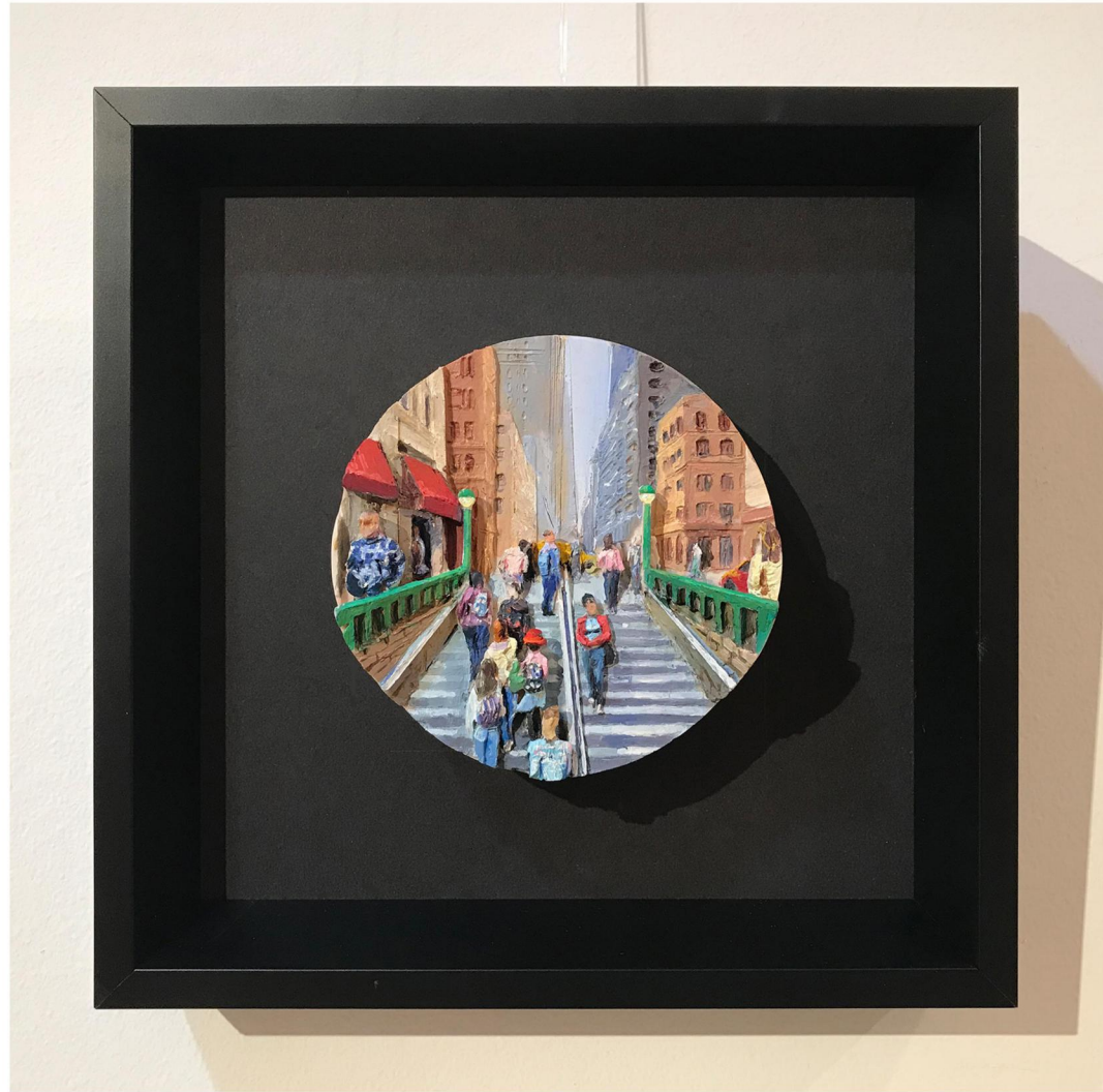
Subway Entrance , 2018 Acrylic on resin, 4.13 x 4.13 x 1.57 inches