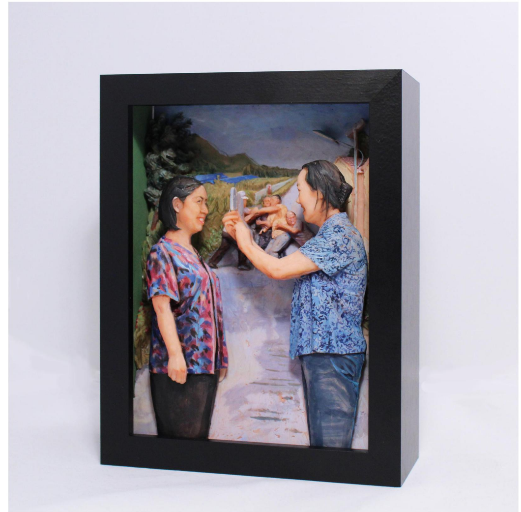
Country Love: Village Beauty , 2020 Acrylic on resin and wood, 9×7×3 inches