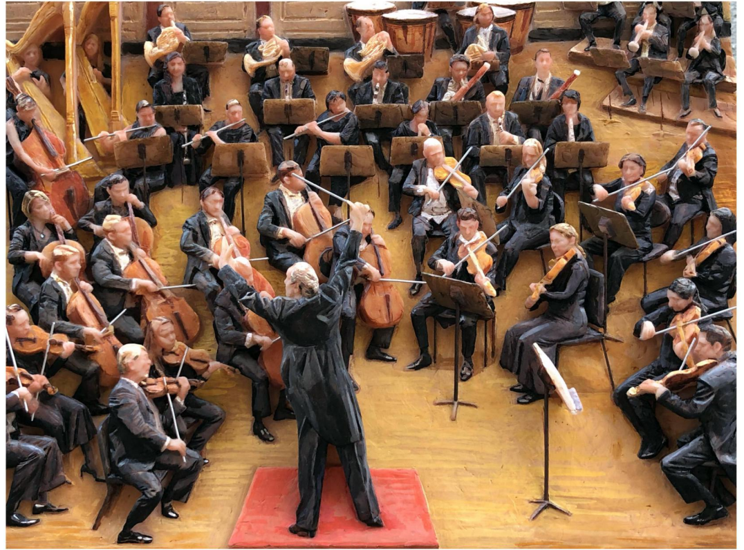
Commission , 2020 Acrylic on resin, metal and wood, 9×11×2.5 inches