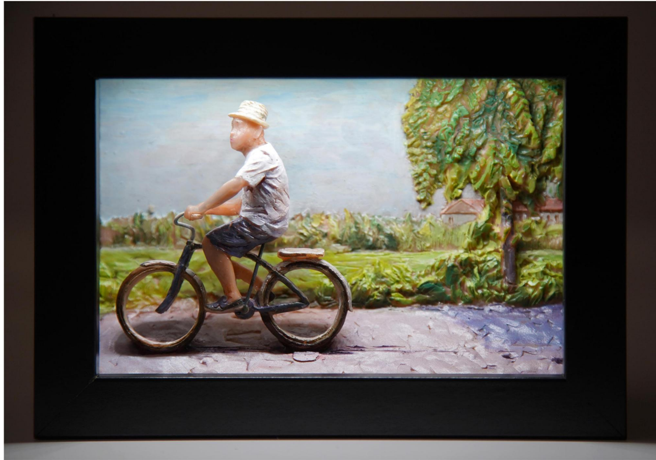
Country Love: Village Governor, 2019 Acrylic on resin, wood and LED light, 5×7×2.75 inches