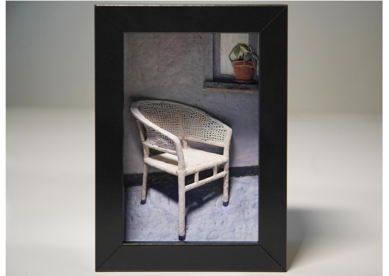
Country Love: Afternoon, 2019 Acrylic on resin and wood, 7×5×2.75 inches