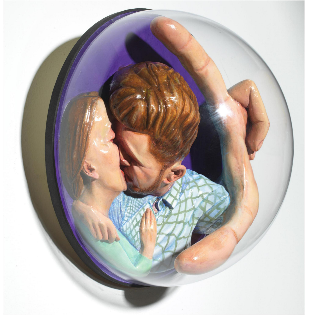
Selfie InstaCouple , 2017 Acrylic on resin, wood, plastic 14" x 14" x 7"